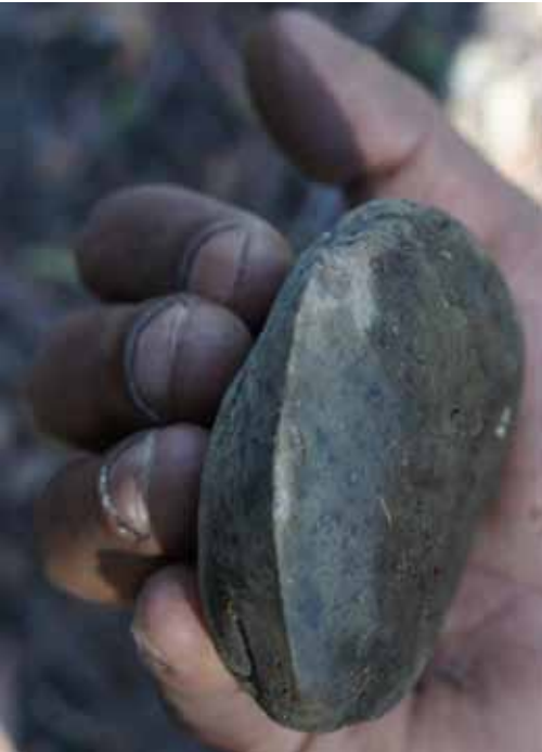
Figure 12. Old hatchets are not uncommon. Some are beautifully worked. All are artifacts should be left where they are found.

Of the many values found along the Way, probably the most significant spring from the natural condition of the surrounding countryside over such a considerable distance. Some examples of the values to be found include: