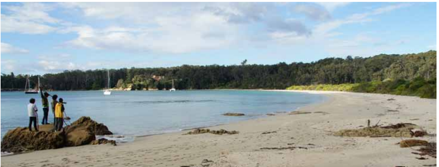
Figure 4. Survey crew at Bilgalera (Fisheries Beach) on Twofold Bay today. The area is Aboriginal land, currently used as a primitive camping area and proposed as major cultural education centre. Edrom Lodge (centre) is where Ben Boyd's manager, the artist Oswald Brierley, built his home in the 1840s. Today Edrom Lodge has replaced it and the chipmill and new naval wharf loom nearby.