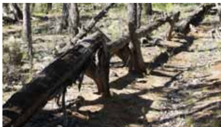
Figure 13. In Byadbo an old settler fence still stands beside the Bundian Way. Its survival is probably due to the dry, rain-shadow conditions and termite-proof resins of the cypress logs.

through the forest. An old campsite at its foot overlooking the grassland of Sheepstation Swamp was on 10th Feb 1987, described in the Sydney Morning Herald as 'the most important Aboriginal artefact site on the far South Coast of NSW'.