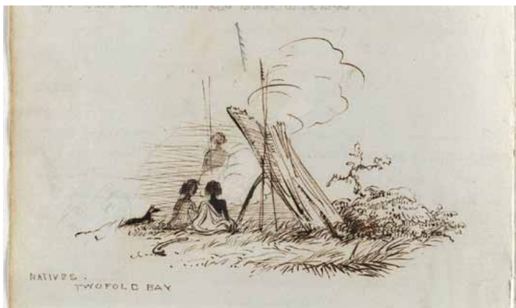
Figure 11. Brierly drew 'Natives- Twofold Bay' soon after his arrival on Twofold Bay

Artefacts were found very frequently along the old sections in the wilder places, often at intervals of less than 10m, even along the graded tracks. Where the tracks became simple unsealed country roads, signs were still there but less