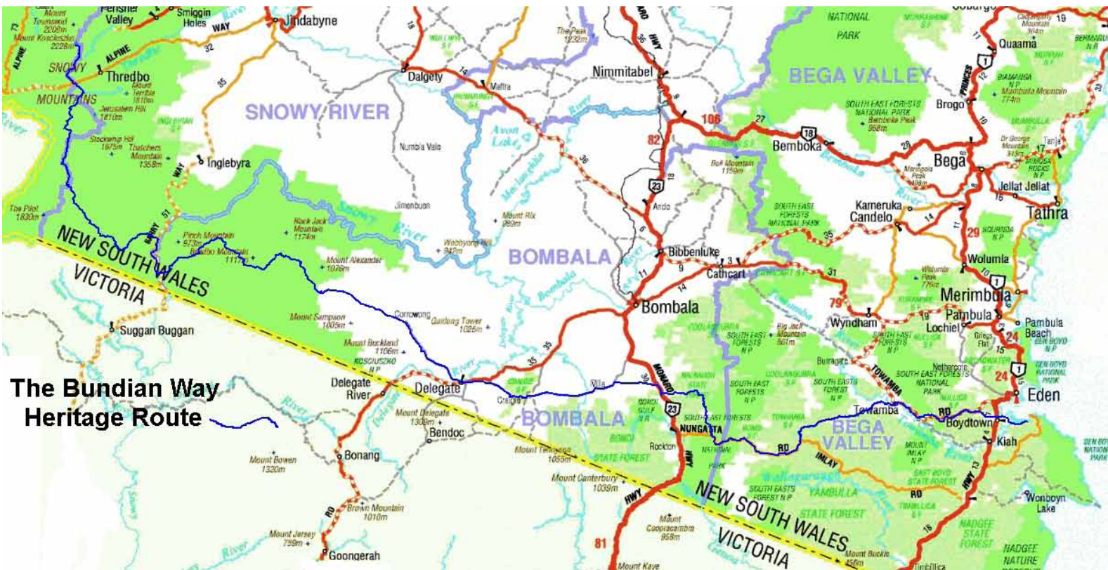
Figure 2. Bundian Way Heritage Route. (marked blue)